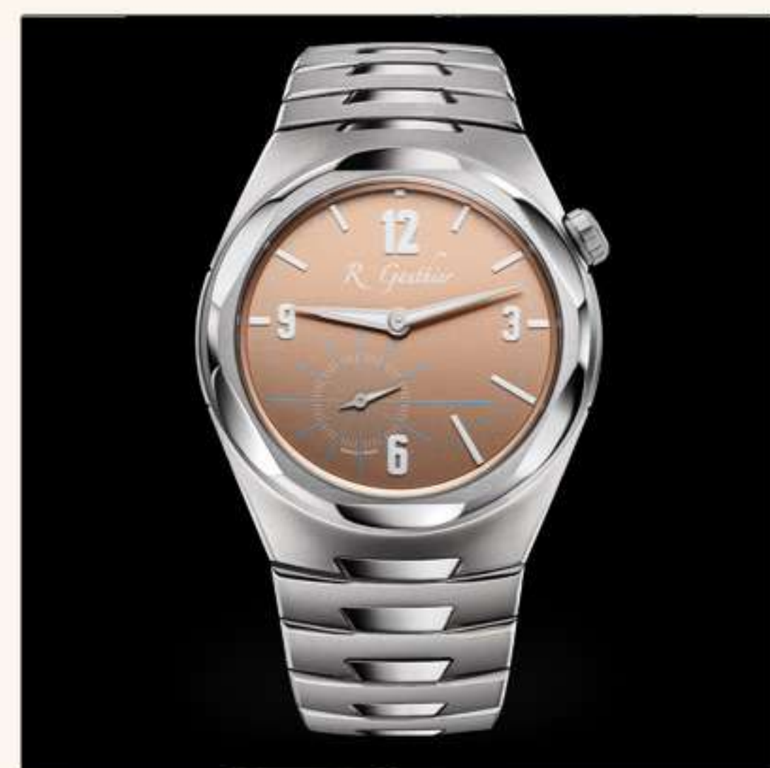
C by Romain Gauthier

at the Salon des Horlogers showroom, Place du Molard 5, Geneva, Switzerland Tuesday, 29th August until Friday, 1st September 2023, 10.00 - 19.00