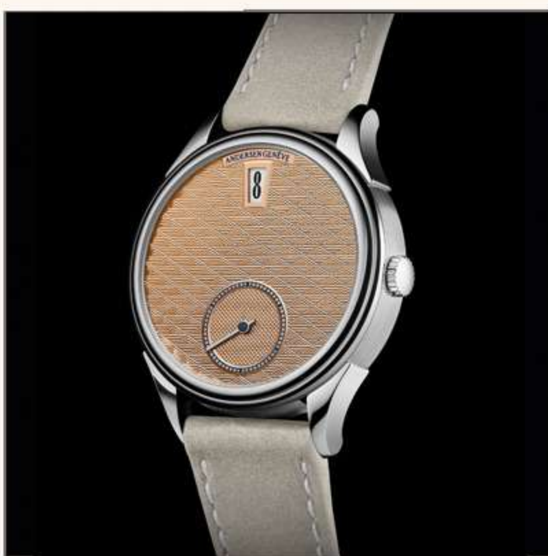
Jumping Hour Rising Sun

and get a hands-on look at their latest creations